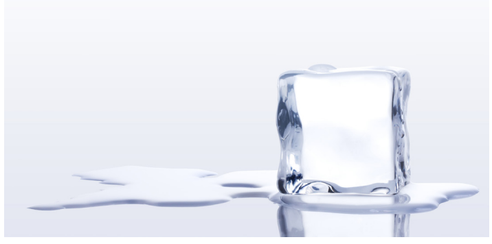
Competing FPGAs can't take their heat.

The value of FPGAs in general is in their flexibility, quick time to market, and "do anything" capability, so using FPGAs in your design can allow you to fix issues without needing to re-spin and redesign boards. This versatility can help you get to market quicker and maximize your engineering effort. Additionally, with Trion FPGAs, you get all of this flexibility at an affordable price, something for which FPGAs have not traditionally strived to accomplish or been known for.